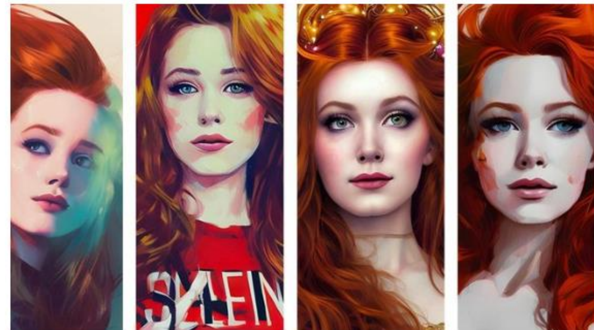
Lensa AI tengah digemari. Namun demikian pengguna harus waspada karena aplikasi ini menyimpan potensi bahaya.